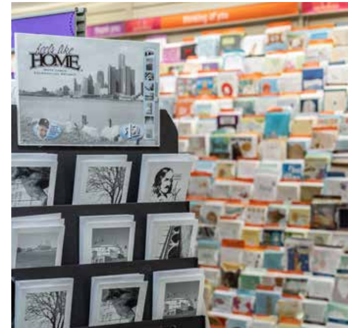
PHARMACY & CONVENIENCE STORE