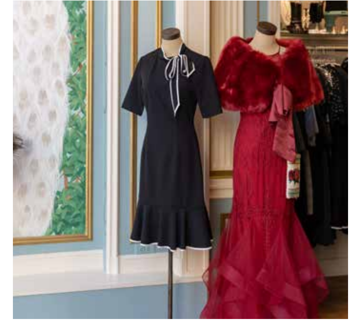
MENS AND WOMENS FASHION