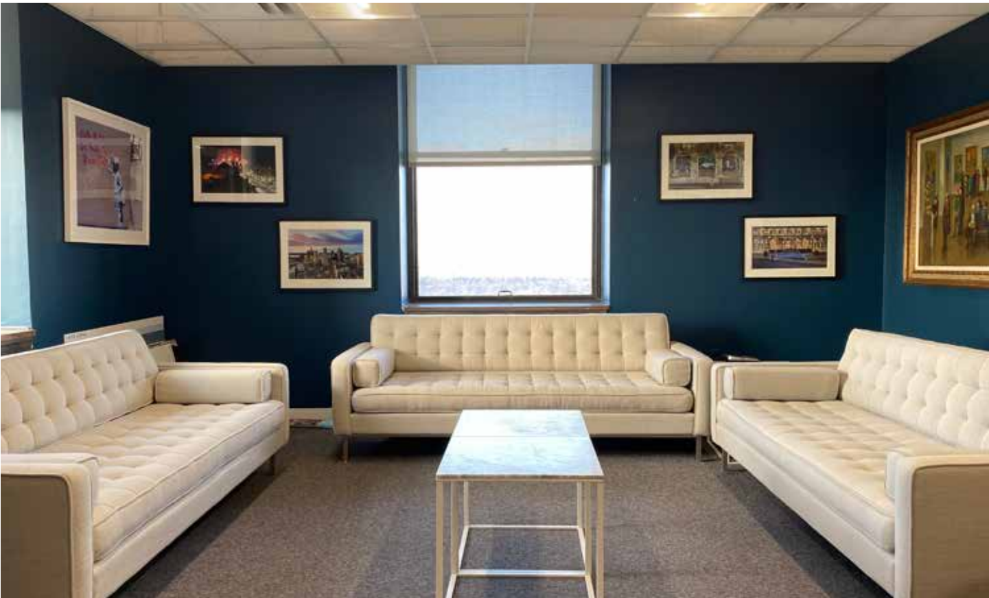
FLOOR PLATES SUPPORT OPEN COLLABORATION AREAS.