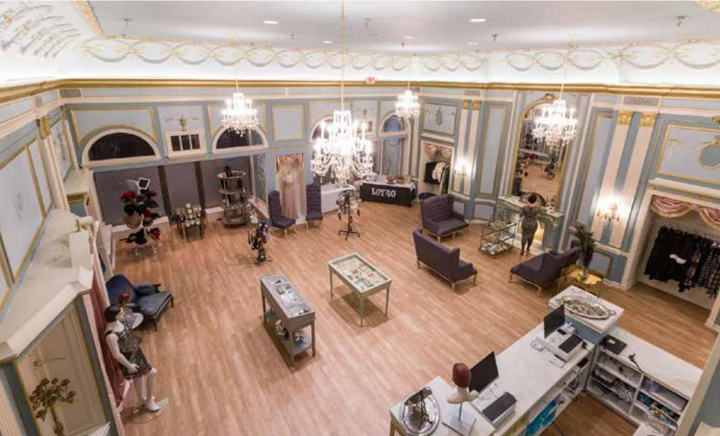
MANY RETAIL SPACES FEATURE HIGH CEILINGS, HISTORIC ARCHITECTURAL DETAILS, AND MEZZANINES.