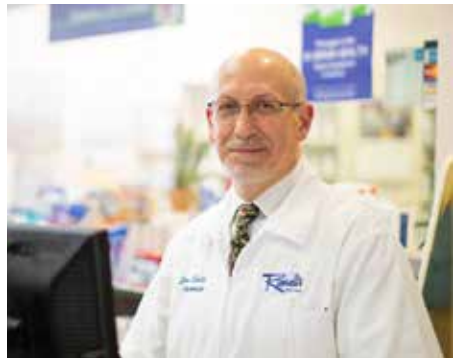
Russell’s Fisher Pharmacy

Pure Detroit is the original Detroit culture shop. Since opening their first store in 1998, Pure Detroit has grown to six locations, each located in landmark Detroit buildings. Their flagship store is located in the Fisher Building in New Center. Pure Detroit uses the rich history of Detroit to provide amazing Detroit inspired apparel, artwork, books and more.