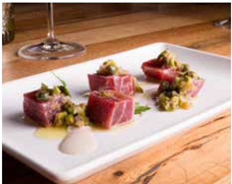
Oak & Reel

The owners of Kiesling cocktail bar have opened Milwaukee Caffe, an Italian-inspired coffee bar. The small neighborhood shop welcomes guests with a walk-up window and sidewalk seating. Next door, Kiesling serves up craft cocktails, beer and wine in a saloon-style setting complete with private rooms and secluded patio.