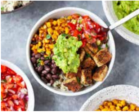
The Kitchen, by Cooking with Que

Beyond Juicery + Eatery is an expanding Michigan restaurant franchise specializing in healthy, accessible breakfast and lunch options. It offers salads, smoothies, wraps, and more made with fresh ingredients daily. Beyond Juice is located on W. Grand Blvd. in New Center.