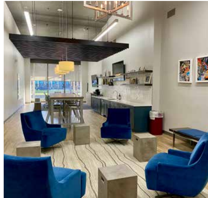
MEETING & EVENT SPACES