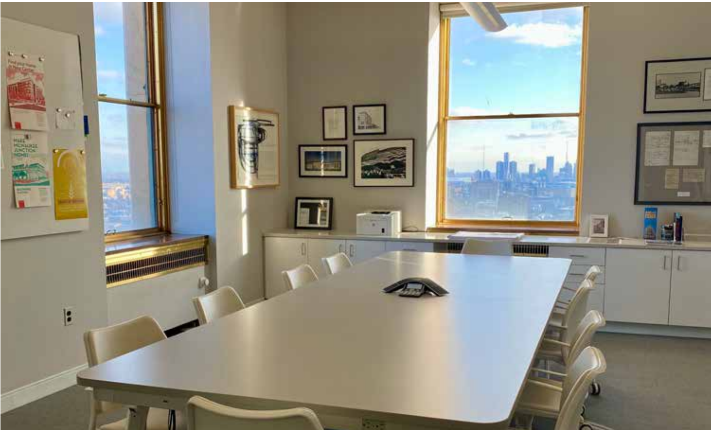
OFFICE TENANTS ENJOY SPECTACULAR CITY VIEWS.