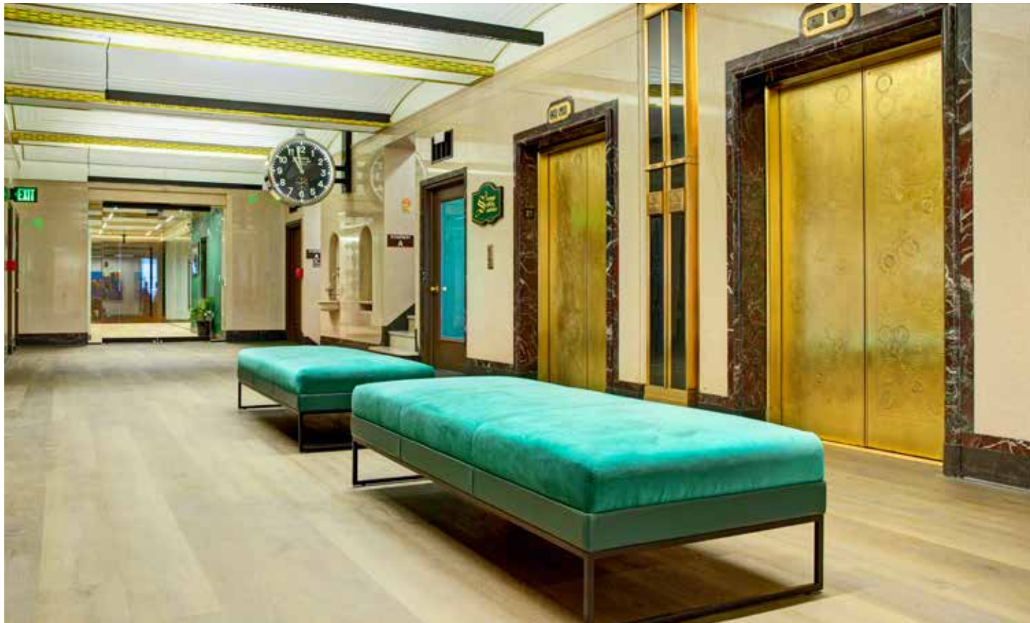
ELEVATOR LOBBIES PROVIDE A WELCOMING EXPERIENCE FOR EMPLOYEES AND VISITORS.