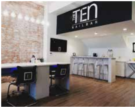
The TEN Nail Bar

Russell’sFisherPharmacyisanindependently owned pharmacy and convenience store in the Fisher Building serving the greater New Center area. Russell’s offers health and beauty products, as well snacks, candy, reading materials, greeting cards, and gifts.