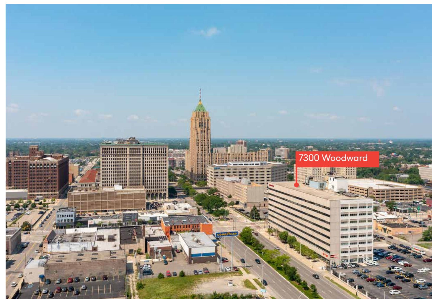
7300 Woodward stands at the corner of Woodward Avenue and Grand Boulevard.