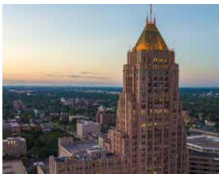
Fisher Building + Fisher Theatre

The Detroit Symphony Orchestra (DSO) is the fourth oldest orchestra in the United States. The DSO performs throughout the Metro Detroit area in both paid neighborhood events and free community concerts. Its main performance center is Orchestra Hall located at The Max M. + Marjorie S. Fisher Music Center.