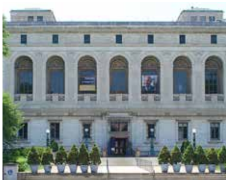
Detroit Public Library

The Detroit Institute of Arts (DIA) has one of the largest and most significant art collections in the United States. It features over 100 galleries, a 1,150-seat theatre, a 380-seat hall for recitals and lectures, a reference library, and a conservation service library. It is ranked as one of the top six museums in the world. The DIA hosts more than 675,000 visitors annually.