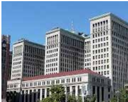
State of Michigan @ Cadillac Place

Detroit Public Library (DPL) opened in 1865 as a 5,000 book collection located in the old Capitol High School on Griswold Street. Today, DPL has 21 locations throughout Detroit with a collection of seven-million plus books. The main library, located on Woodward in Midtown, is listed on the National Registry of Historic Places.