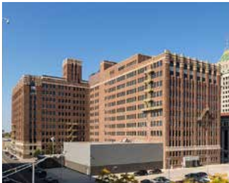
College for Creative Studies

The College for Creative Studies (CCS) is a private college in Detroit that enrolls more than 1,400 students focused on art and education. In addition to its main campus in Midtown, CCS also operates the A. Alfred Taubman Center for Design Education in New Center. CCS plays a key role in Detroit’s cultural and educational communities.