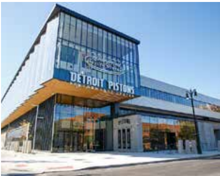
Pistons Performance Center + HFHS Center for Athletic Medicine

The Ford Piquette Avenue Plant is a museum dedicated to preserving Ford Motor Company’s first factory and its legacy as the birthplace of the Ford Model T which put the world on wheels. A National Historic Landmark, the plant hosts visitors from around the world with public and private events from car shows to weddings.