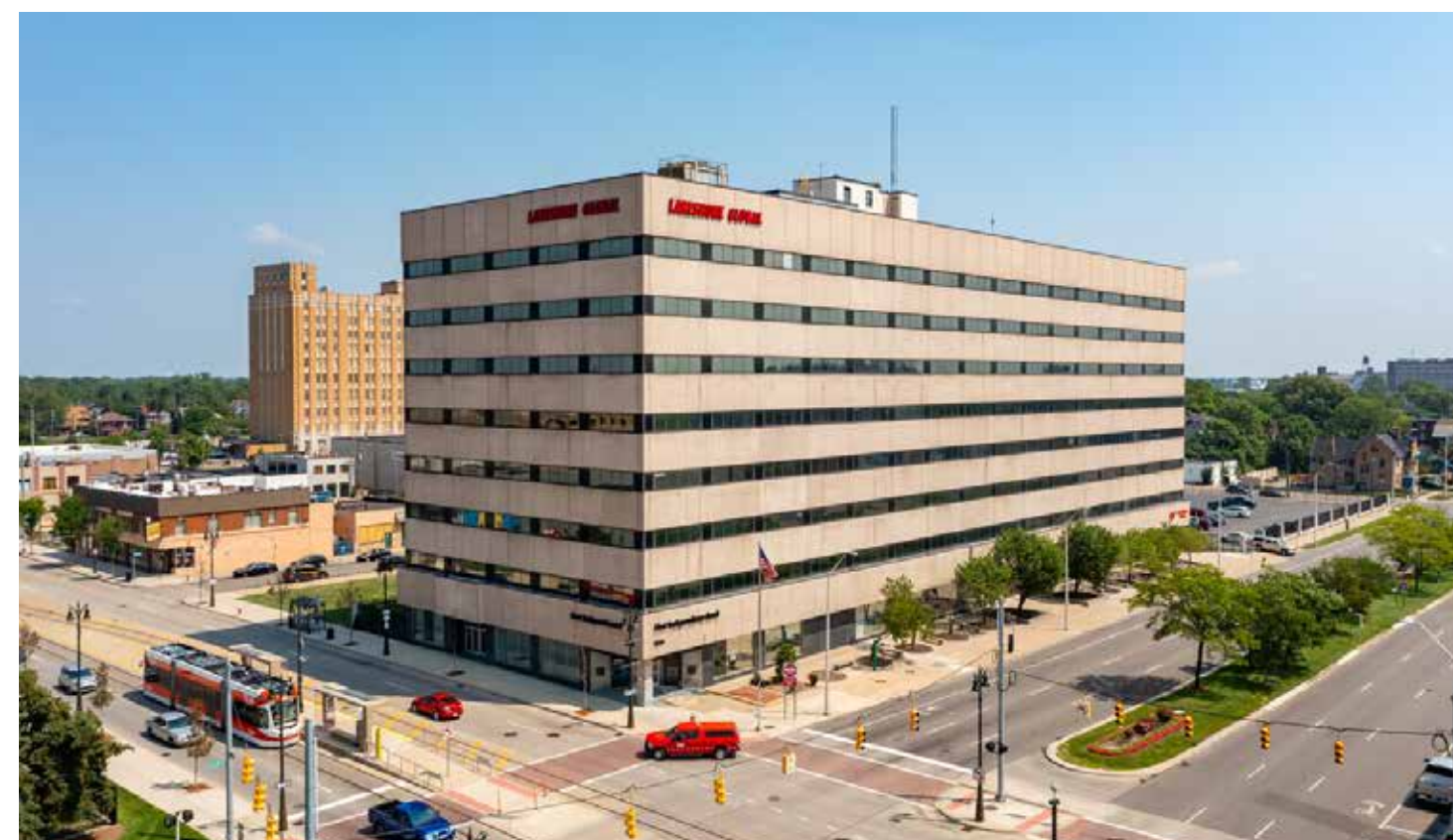
The QLine stop at 7300 Woodward provides transportation to Midtown and Downtown.