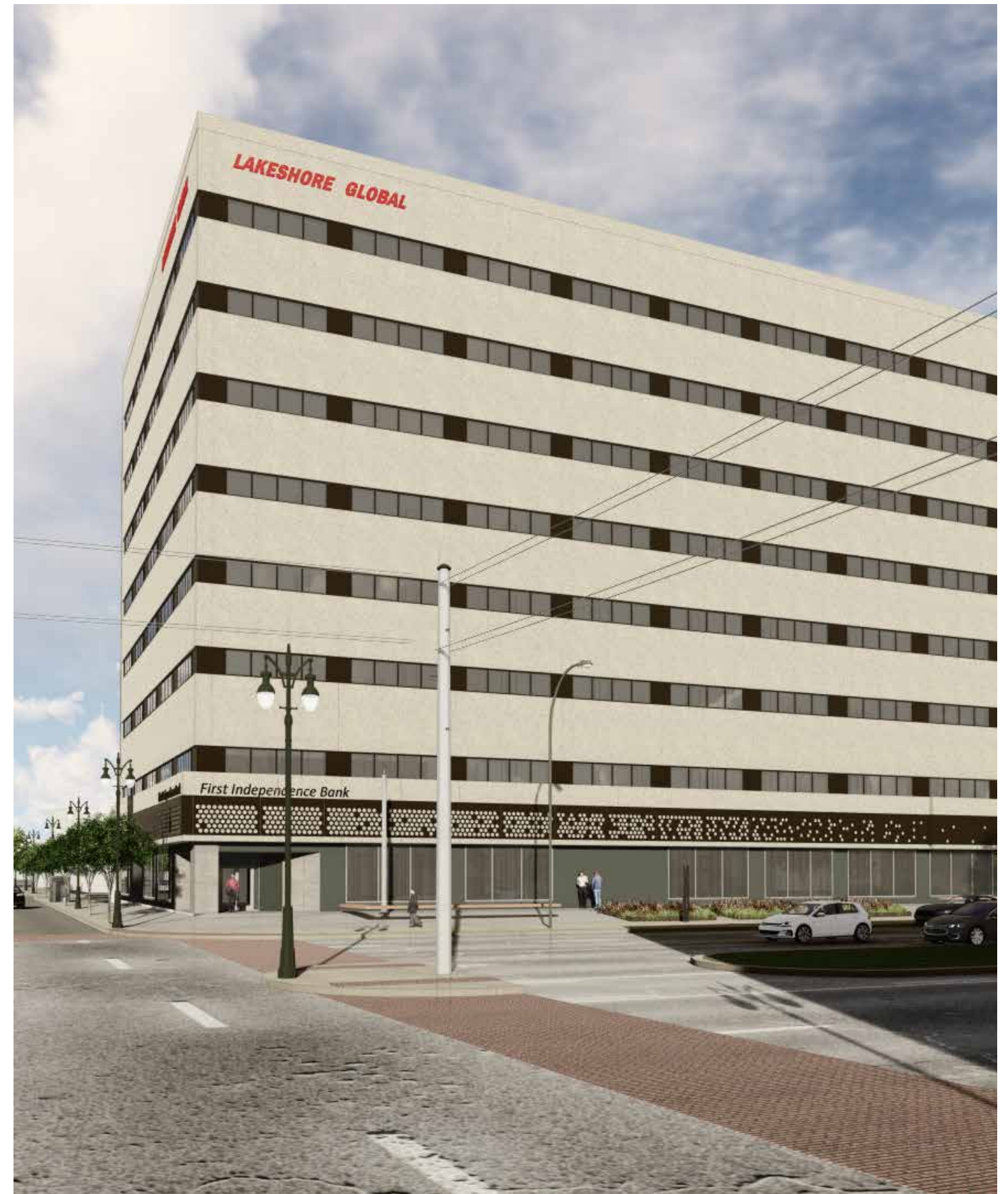
Conceptual rendering of exterior.