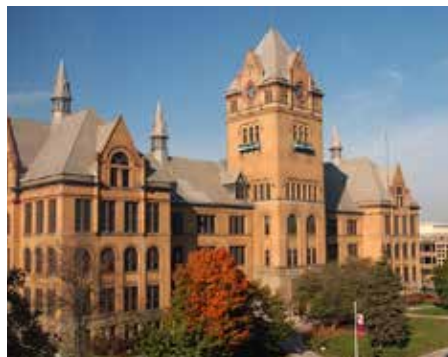
Wayne State University

TechTown is an entrepreneurial hub focused on helping tech startups and local businesses launch and grow. It is part of the Wayne State University system and offers coworking, office, meeting and event space in the greater New Center neighborhood.