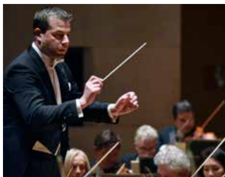
Detroit Symphony Orchestra

Wayne State University (WSU) is a public research university in Detroit and the 3rd largest university in Michigan consisting of 13 schools and colleges. WSU offers nearly 350 programs to more than 27,000 graduate and undergraduate students in Midtown Detroit.