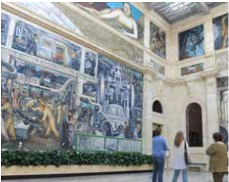
Detroit Institute of Arts

A new office, coworking, and event venue has opened on East Grand Blvd. in Milwaukee Junction. The historic building features a variety of indoor and outdoor spaces for meetings, private events, and public programs. Chroma-hosted events include chef dinners, art exhibits, festivals, and more.