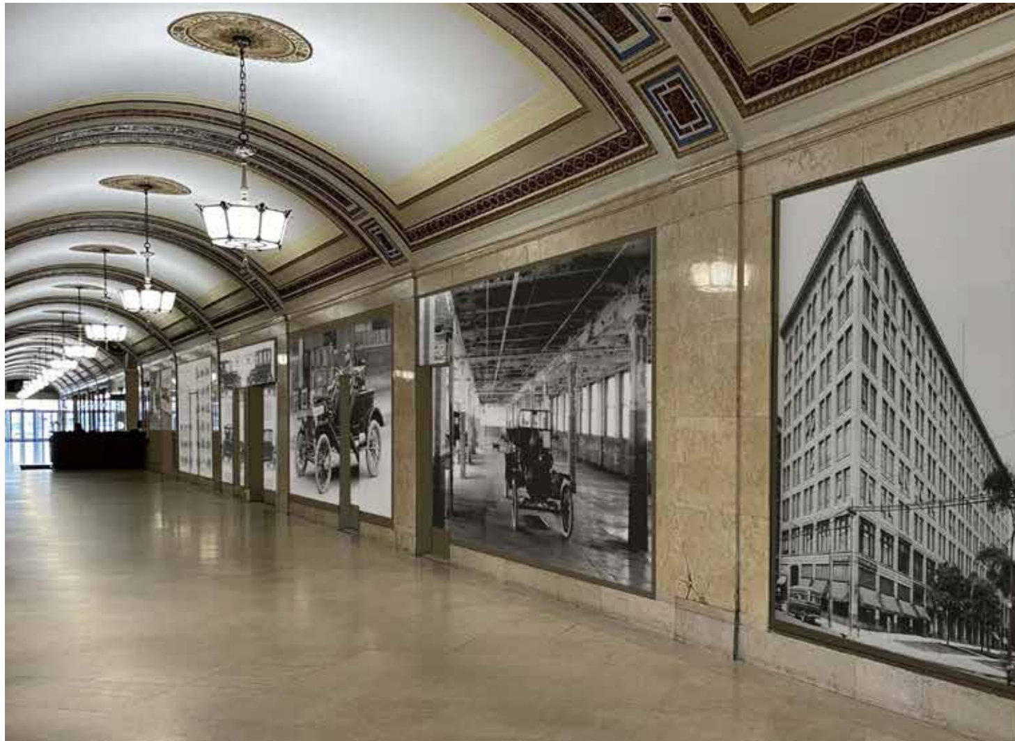
Conceptual rendering of corridor art.

Modern comfort and conveniences are already underway with the installation of modernized elevators and an upgraded HVAC system.