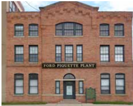
Ford Piquette Avenue Plant

The College for Creative Studies (CCS) is a private college in Detroit that enrolls more than 1,400 students focused on art and education. In addition to its main campus in Midtown, CCS also operates the A. Alfred Taubman Center for Design Education in New Center. CCS plays a key role in Detroit’s cultural and educational communities.